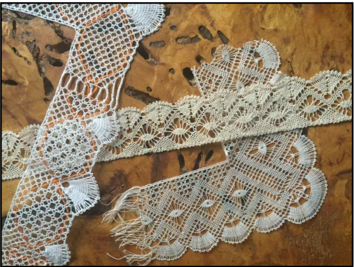
Sample Suggestions from the Desk of Sylvie Nguyen