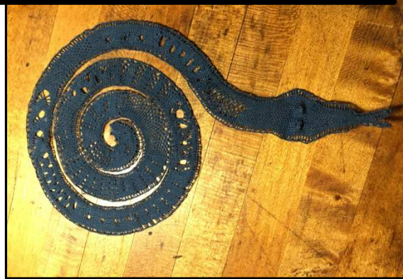
Above: Finished Snake, and here an alternative project.