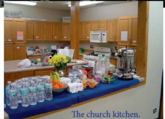
The church kitchen.